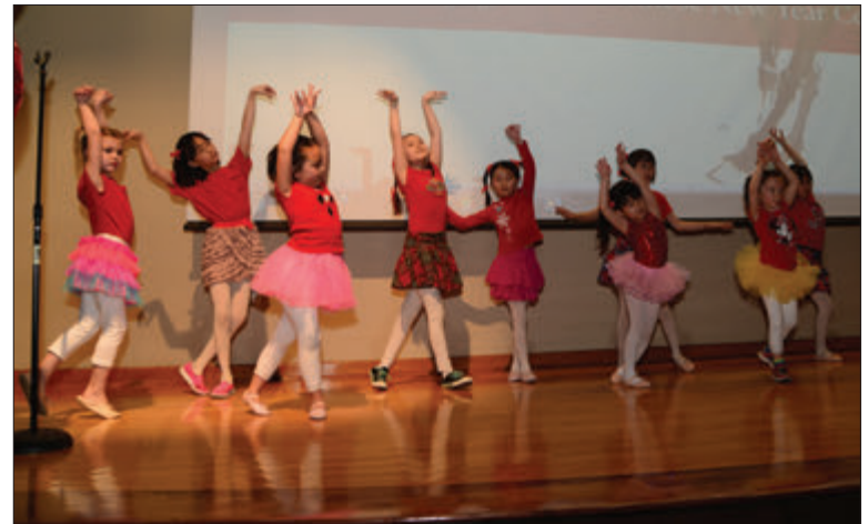
Young dancers from the New Mexico Chinese School of Arts and Language perform at last year's New Year celebration in Albuquerque.