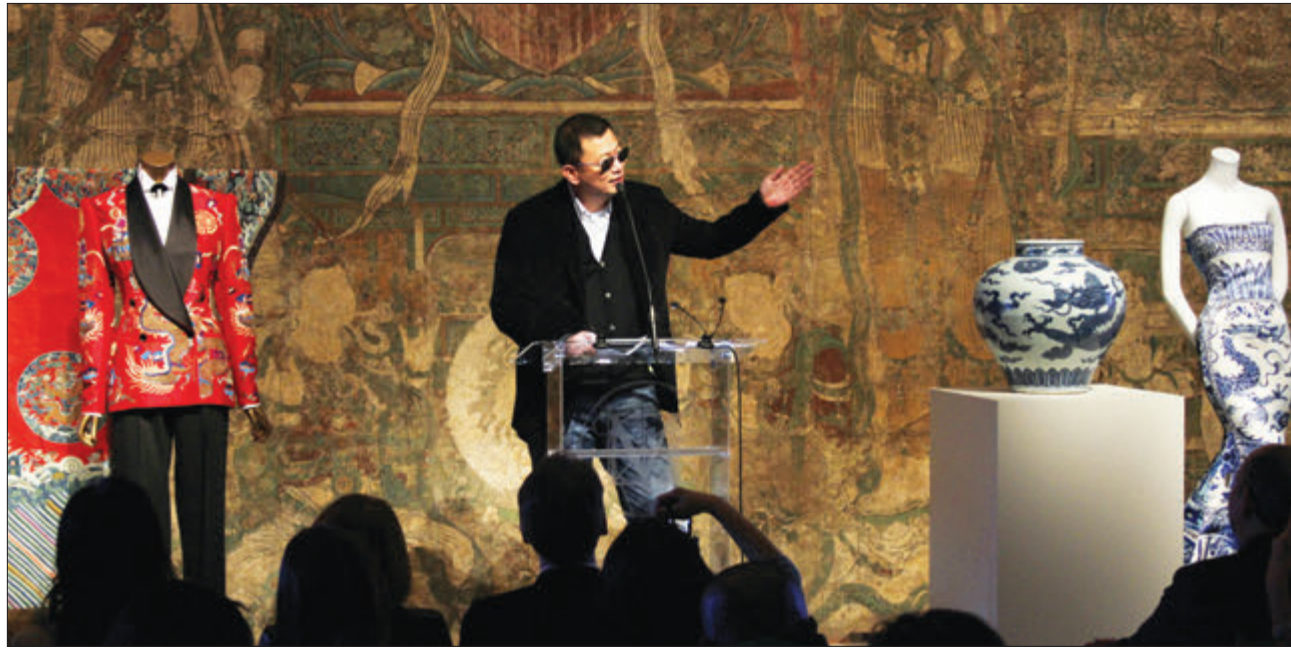
Chinese film director Wong Kar-wai speaks on Monday morning at the Metropolitan Museum of Art in New York City. The museum will be unveiling its new China-themed exhibit in May, exploring how China influenced Western fashion designers for centuries. The exhibit will feature more than 130 examples of haute couture and ready-to-wear pieces next to Chinese masterworks.