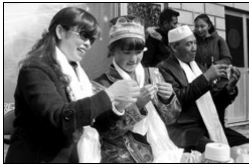
A Han woman (left) and a Tibetan girl make traditional local food in Lhasa on Sunday, to greet Spring Festival and Tibetan New Year, both of which come on Thursday.

Although the heavy snow that fell in Lhasa two days ago has not melted yet, residents are gearing up for the festival. Many of the hot shopping spots, such as the Ramoche