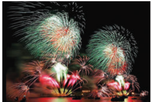
Fireworks display over Hudson River in a file photo.

Viewing will be possible along the Hudson River from both the